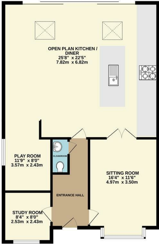
GROUND FLOOR 982 sq.ft. (91.3 sq.m.) approx.